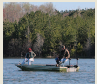
The 2020 HCWA Public Fishing Season kicks off the first week in March and runs through the end of November.

For more information on HCWA Fishing and Boating, check out our website at www.hcwa.com .